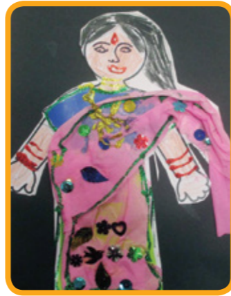
A colourful artwork by the children of a lady wearing the sari