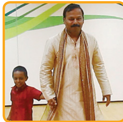
A father and child gamely taking part in the fashion show

At the shop, the children asked the shop owner about the materials used to make traditional costumes, the differences between costumes for men, women and children, and the occasions during which such costumes would be worn. After the trip, the children shared their findings and made two-dimensional traditional costumes from paper. To conclude the project, the teacher invited the children's families to be part of a fashion show showcasing their traditional costumes.