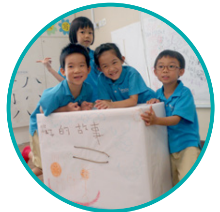
The children posing with their illustration of a story about chopsticks