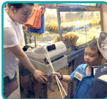
A goreng pisang stall owner explains the use of long chopsticks when frying fritters to avoid getting scalded by the hot oil.

Under the teachers' guidance, the children visited a nearby hawker centre and coffee shop to interview stallholders and diners on the use of chopsticks.