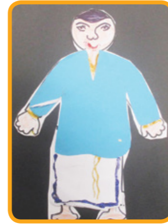
The children's artwork of a traditional costume for men