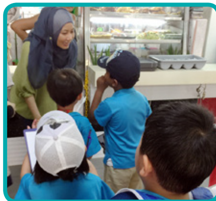
When asked about the lack of chopsticks at a Muslim stall, the owner explains the Malay custom of using one's right hand, or forks and spoons to eat instead of chopsticks.