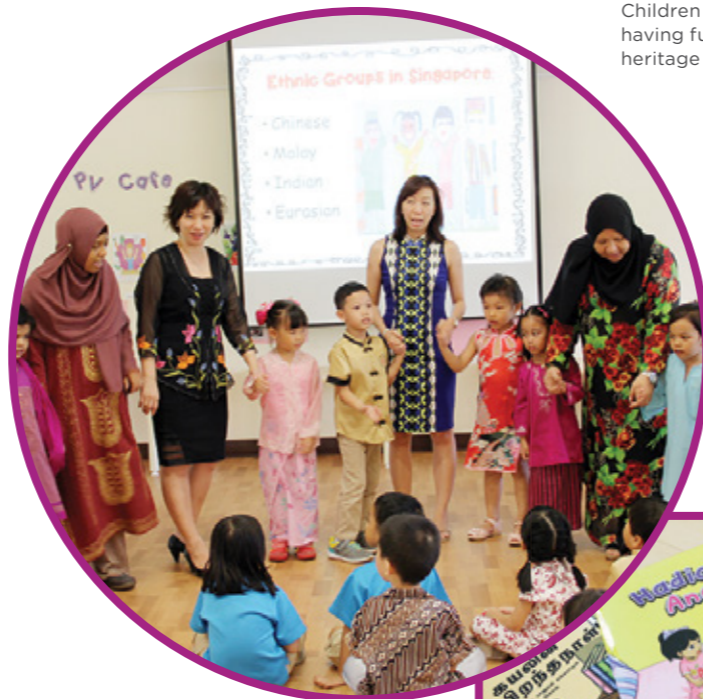
Staff and children of MOE Kindergarten @ Punggol View celebrating Racial Harmony Day