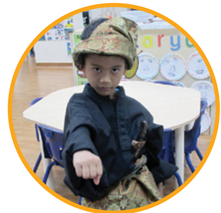
Looking brave and fierce in a Silat costume