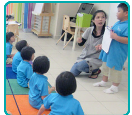
A child sharing what he has learnt from the trip to the hawker centre

After the outing, the children wrote a Chinese poem about chopsticks and discussed the differences between long, short and disposable chopsticks. They also observed that chopsticks are typically used by the Chinese to eat Chinese food.