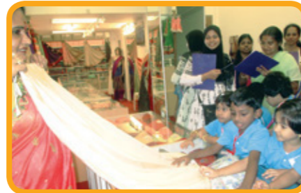
The children feeling the material used for Indian traditional costumes at a shop

The children decided to find out more about traditional Indian costumes after noticing characters dressed in eye-catching costumes in some of their Big Books. In addition to watching videos and viewing photographs of traditional Indian costumes, the children also went on a field trip to a traditional costume shop in Little India.