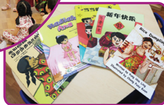
A favourite amongst children - our signature Big Books with a distinct Singapore flavour in English and Mother Tongue Languages