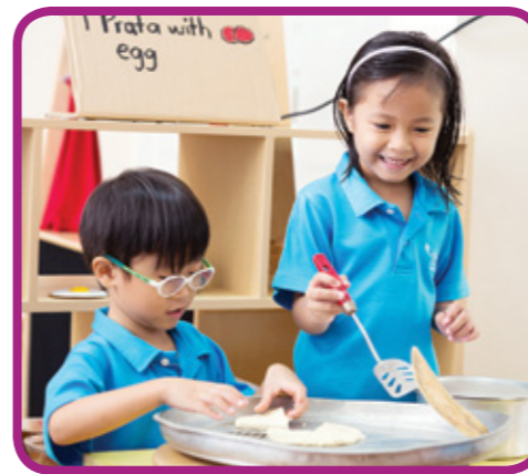
Children at MOE Kindergarten @ Tampines having fun at the "prata stall" in their local heritage learning centre

Besides helping children gain confidence in and develop a love for using two languages, MOE Kindergartens also aim to provide experiences that help children develop a better understanding and appreciation of the local ethnic culture. This is done through the celebration of festivals and learning experiences using games, songs and reading materials with a distinct Singapore flavour.